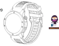
TRANSFORMERS TF-H09 Smart Watch