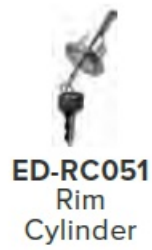
ED-RC051 Rim Cylinder