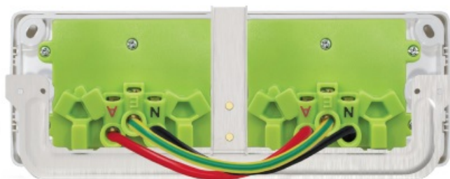
Supplied with mounting bracket and prewired tails.