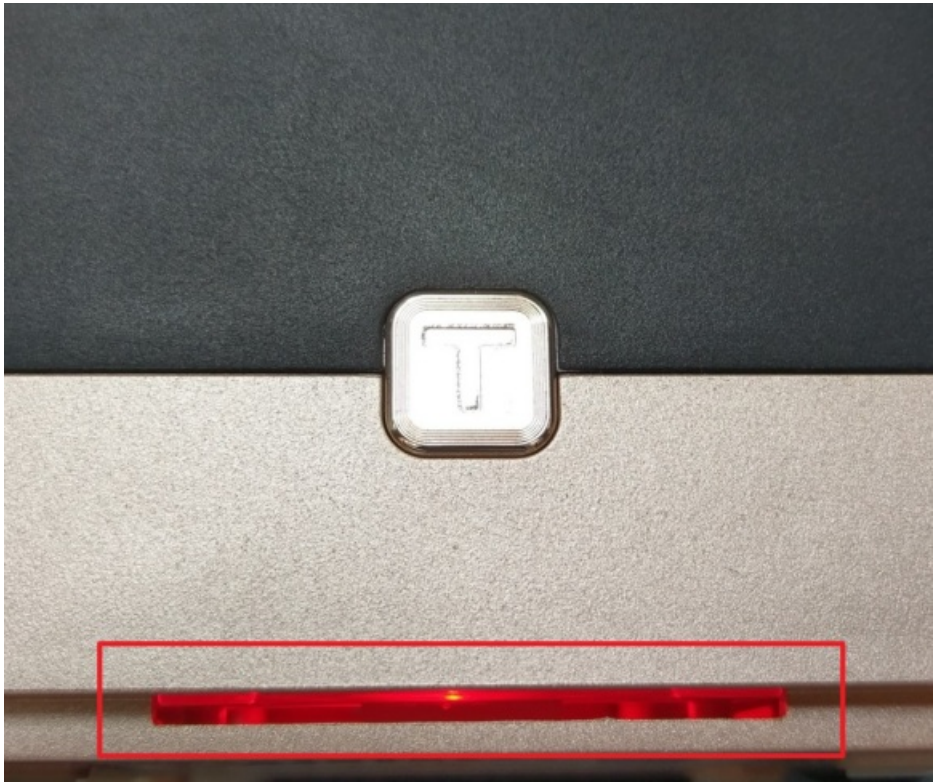
STEP-4: The light shows the status description table