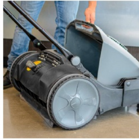
LARGE HOPPER Collect up to 14.5 gallons of dust and debris quickly