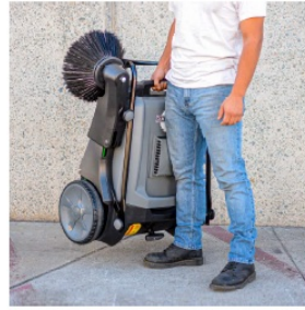
LIGHTWEIGHT/COMPACT Sweeper fits through doorways and can easily be carried