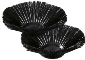
ROBUST BRISTLES Long-lasting nylon bristles designed to collect dirt and litter!