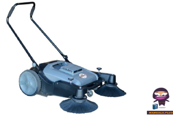
TOMAHAWK eTOS30, TOS38 Push Sweeper