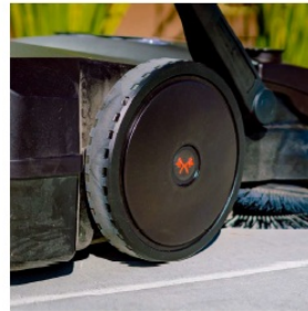
RUGGED WHEELS Easily clean up against walls, curbs, tight spaces, and more!