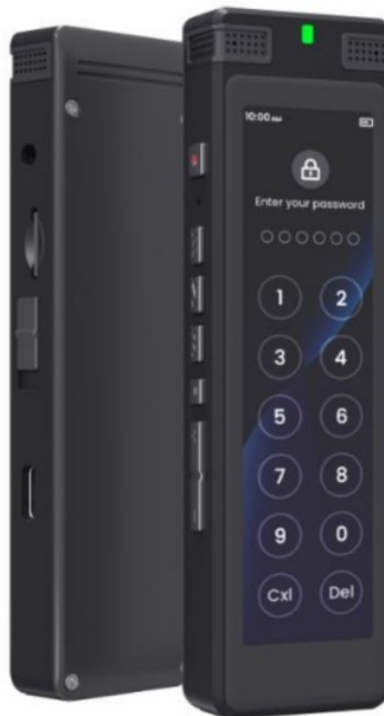
TIMMKOO SR1 AI Voice Recorder