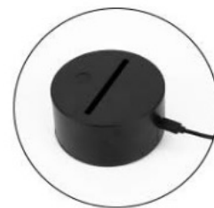
Micro USB electricity supply