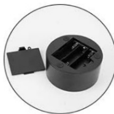
The lamp powered by batteries and you can put it in any place you want. (Use 3 AAA batteries)