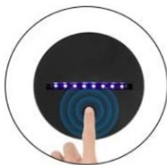
Touch to open