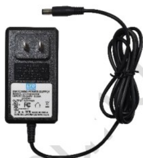
AC Power Adaptor (HTE)