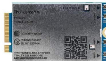
T62 M.2 Module