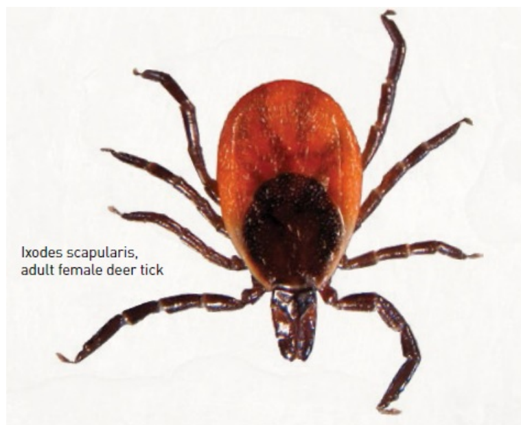
Ixodes scapularis , adult female deer tick