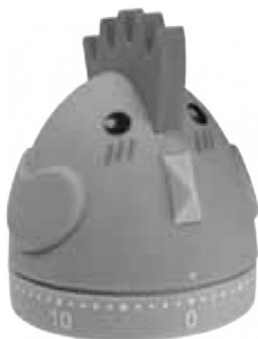
Kat. № 38.1040