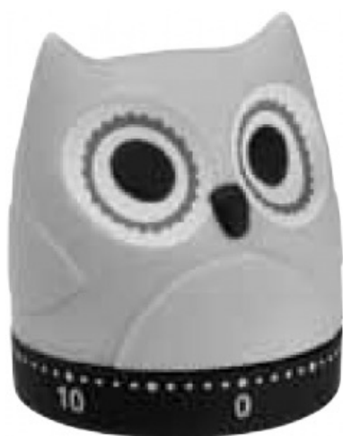
Kat. № 38.1039