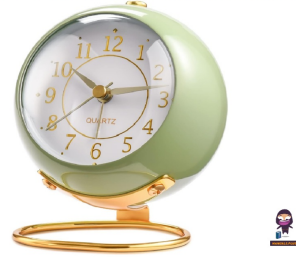
TETINO Y-1004 ANALOG ALARM CLOCK