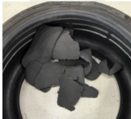
Figure 1 – Loose NVH foam inside tire

If the NVH foam is properly attached, the imbalance was not caused by foam separation. Go to section Reinstall Tire.