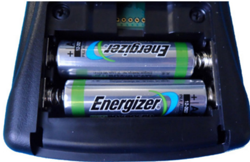
Figure 1: Battery Polarity