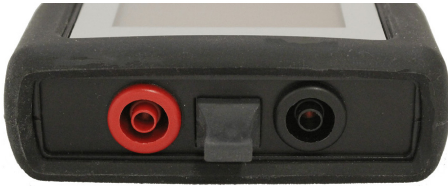
Figure 2: IRIG-B Analyzer Inputs