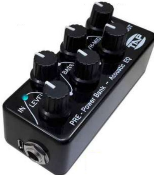
PRE-FP Battery Free Preamp

PRE-FP Active Self Powered Preamplifier Owner's Manual