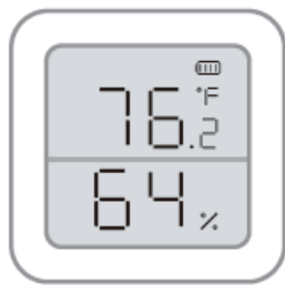
Thermometer and Hygrometer (Meter)