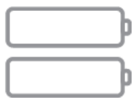
2 x AAA Batteries