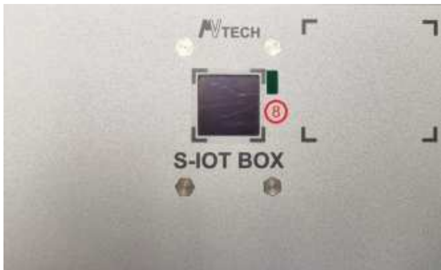
(IOT_4_VIBRATION TOP Exterior)