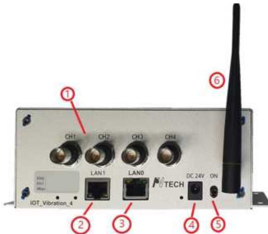
(IOT_4_VIBRATION Front Exterior)