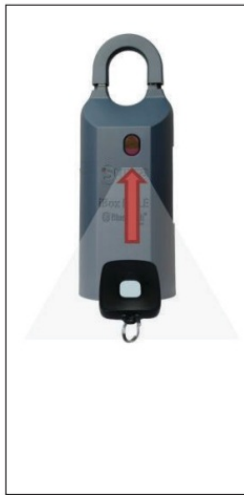
Infrared Keybox with fob