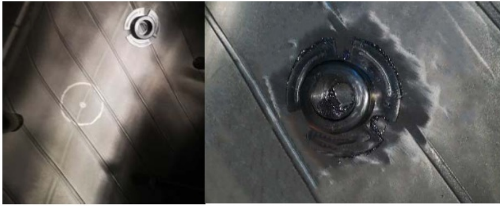
Fig.1 Installation Diagram of Rubber Housing