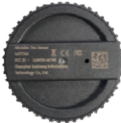
Fig.2 Installation Diagram of Transmitter