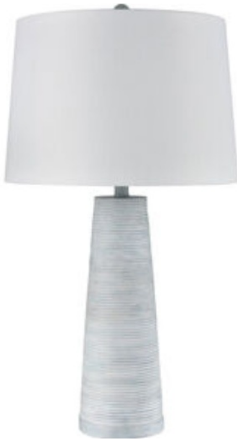
Set of 2 Table Lamps M# L333329CUECOM