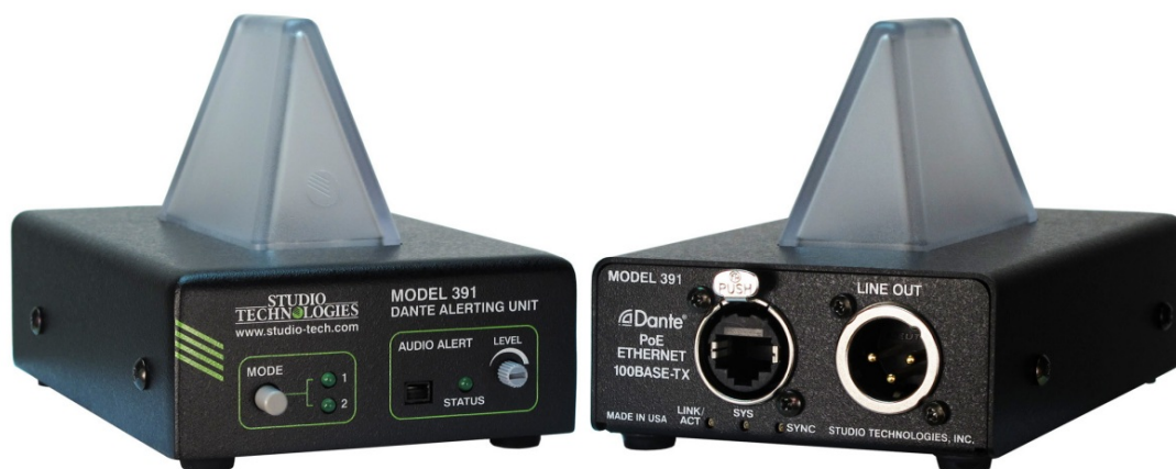
Figure 1. Model 391 Dante Alerting Unit front and back views

The Model 391 is directly compatible with the call signals generated by the popular Studio Technologies’ Dante-enabled beltpacks and intercom stations. These Dante-connected user devices generate 20 kHz tones whenever their call button is pressed. Model 391 applications can also employ Studio Technologies’ Model 45DC or Model 45DR Intercom Interface units to provide compatibility with legacy analog PL intercom systems. The Model 45DC is compatible with Clear-Com ® PL circuits that use a DC voltage to indicate call activity. The Model 45DR supports the TW-series PL intercom circuits from RTS ® which directly use 20 kHz tones for call activity. Both interfaces will convert the associated analog PL circuit’s audio and call signals to Dante’s digital audio. Once in the Dante “world” the call signals and user audio is compatible with the Model 391 Dante Alerting Unit as well as user belt packs such as the Model 370A, Model 371A, and Model 374A. In addition, the Models 348 and 5304 Intercom Stations can send and receive compatible call signals.