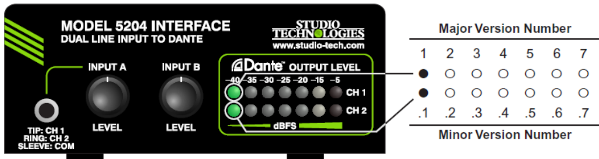
Figure 2. Detail of front panel showing the LEDs that display the firmware version. In this example, the version shown is 1.1.

As previously discussed in this guide, upon power up the meter LEDs are used to briefly display the version number of the Model 5204's firmware (embedded software). This information is typically only necessary when working with the factory on support issues. The meter LEDs will first go through a display sequence followed by an approximately 1-second period where the version number will be indicated. The top row of seven LEDs will display the major version number with a range of 1 to 7. The bottom row of seven LEDs will display the minor version number with a range of 1 to 7. Refer to Figure 2 for details.