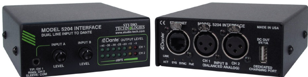
Figure 1. Model 5204 Dual Line Input to Dante Interface front and rear views