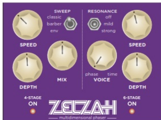
VINTAGE DUAL PHASER