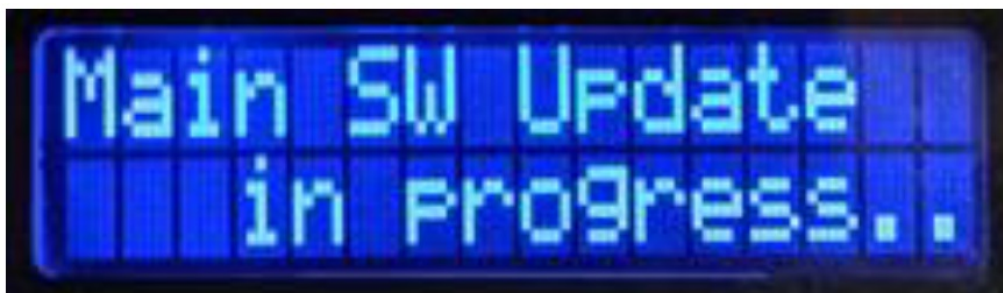
(Figure 1. Firmware Update Text)

Warning: Do not turn camera off or eject battery tray during the software upgrade process. Loss of power to the camera may cause damage.