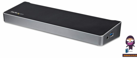
StarTech USB3DOCKH2DP Triple Video Docking Station