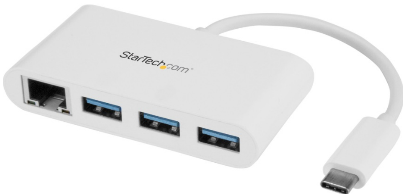
Product Diagram (HB30C3A1GEA)