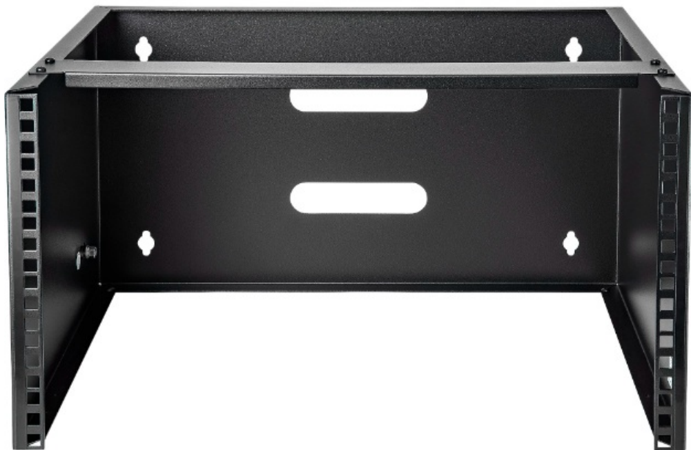
Product Diagram (WALLMOUNT6)