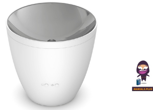
Stadler Form Zoe Aroma Diffuser