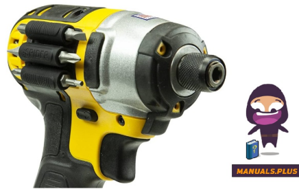
SPIDER v2 Bit Gripper Tool Holster