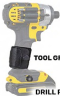
TOOL GRIP DRILL PIN