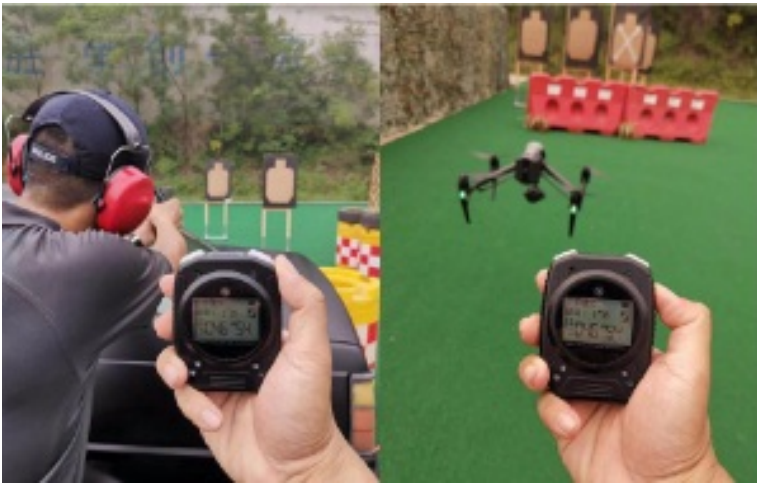
5.3 2020 IPSC Rifle level 3 competition in Ukraine