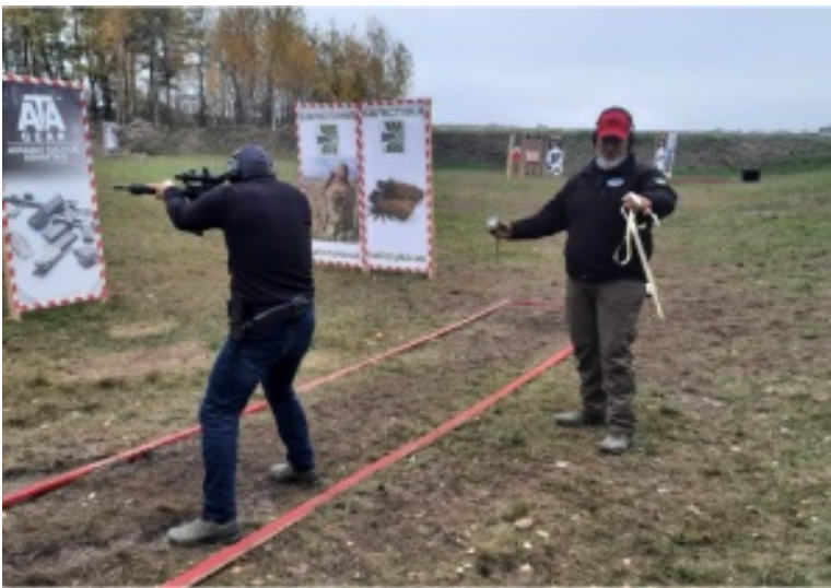
5.4 Used in lots of club s shooting train ing and competitions all over the world.