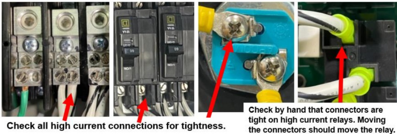
Figure 1: High Current Connections