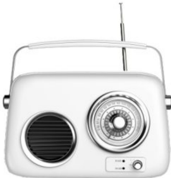
Retro Radio Speaker FB-R302 User Manual