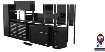
sonic MSS Plus 8 Drawers with Storage