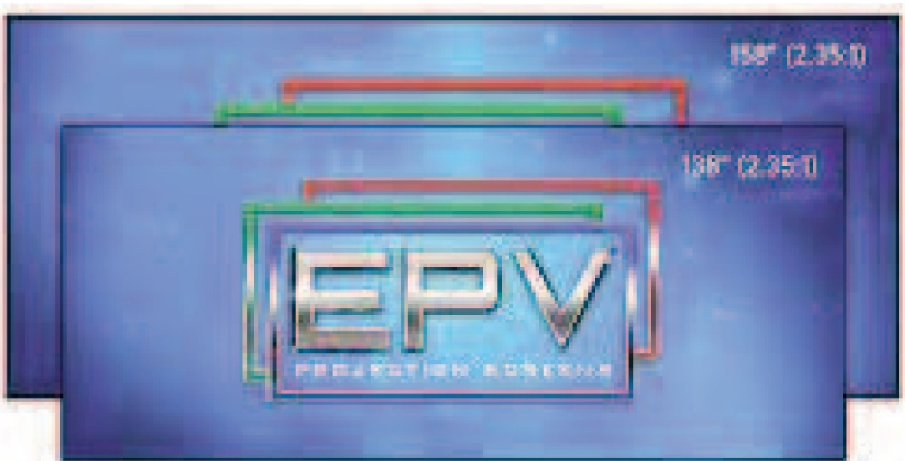
EPV Screens Sonic AT8 isf eFinity Acoustically Transparent Projection Screen Doug Blackburn