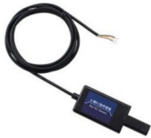
Soil EC value sensor