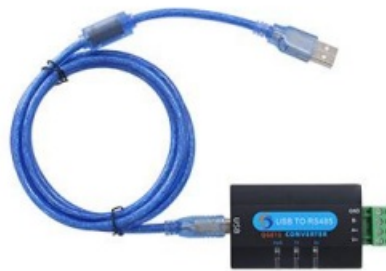
Isolated USB-485 converter

Connect to computer to transmit measurement data