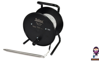
Solinst 103 Data Sheet Tag Line