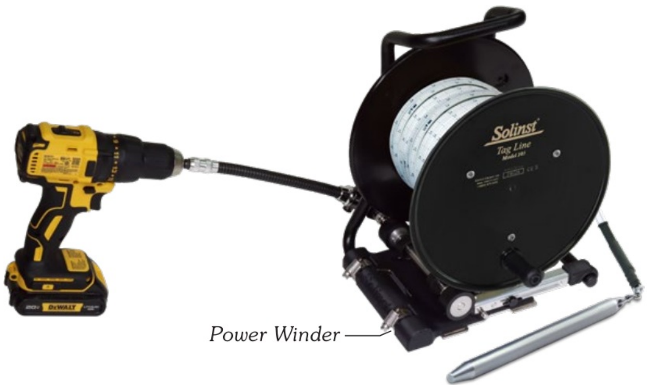
Power Winder —