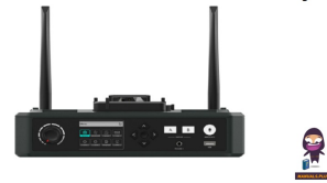
Solidcom C1-HUB Base For Dect Intercom System