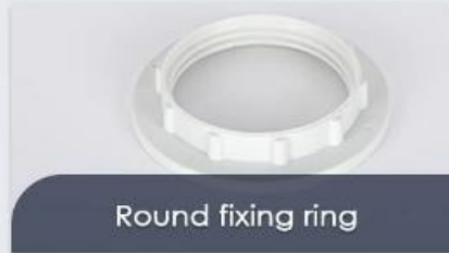
Round fixing ring