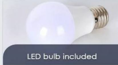
LED bulb included