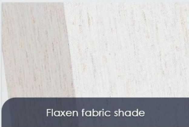
Flaxen fabric shade