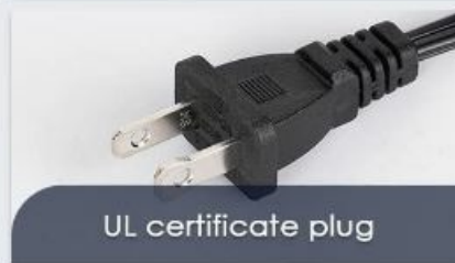
UL certificate plug