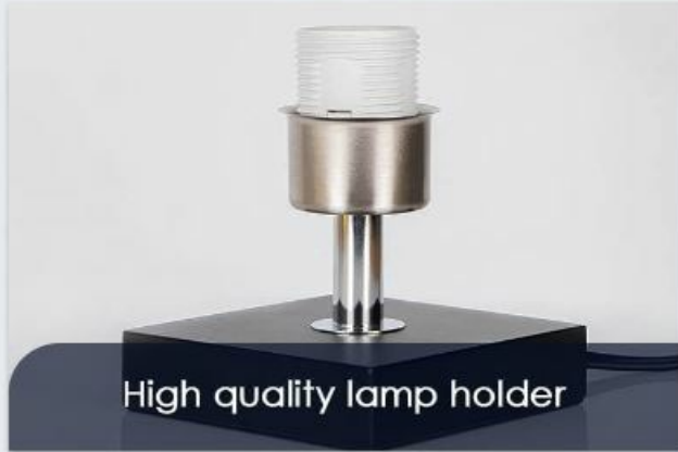
High quality lamp holder