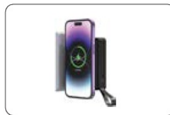
Magnetic Wireless Charger