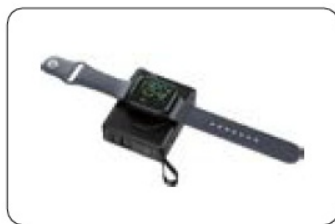
Charging the Apple Watch