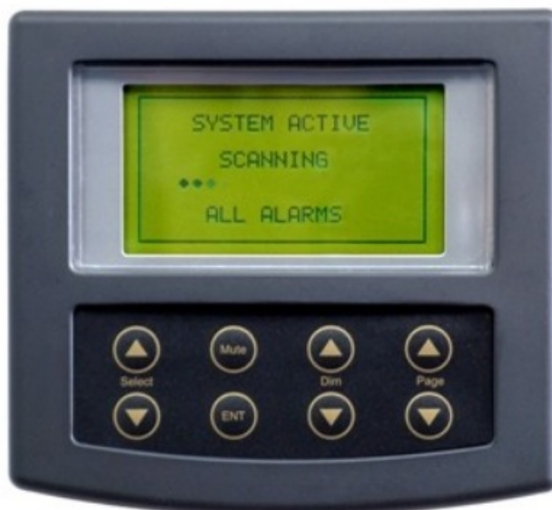
smartswitch BSW-1000 Single Bilge Controller