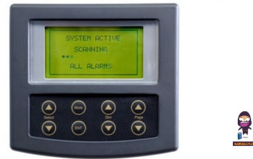
smartswitch BSW-1000 Single Bilge Controller