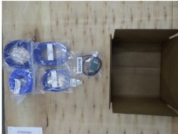
Figure 10: CAT5 Package

2025 Smartrise Engineering, Inc. All Rights Reserved