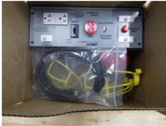
Figure 5: Inspection Box, Light Guard, 15ft CAT5