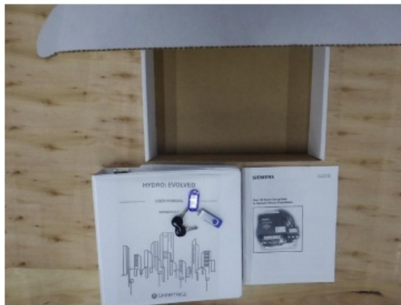
Figure 7: Enclosure Keys, USB, Hydro:Evolved User Manual, Soft Starter User Manual