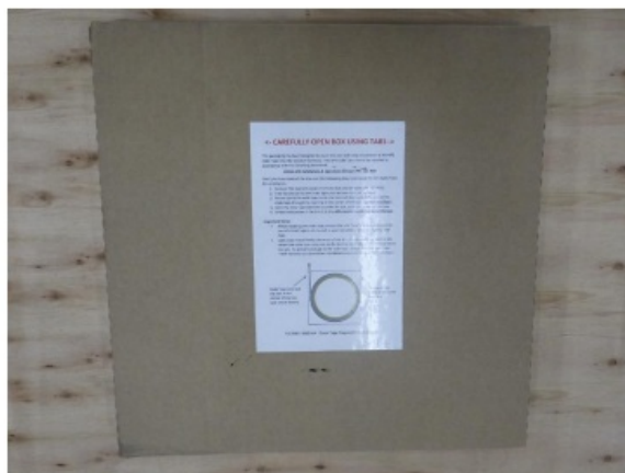
Figure 8: Landing Tape Unboxed