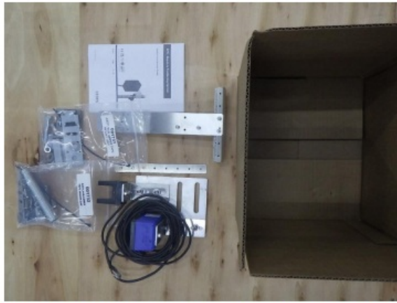
Figure 9: Landing System Tape Hardware – DZ Blade, Camera, Extension, Upper & Lower Tape Mount, Landing System User Manual