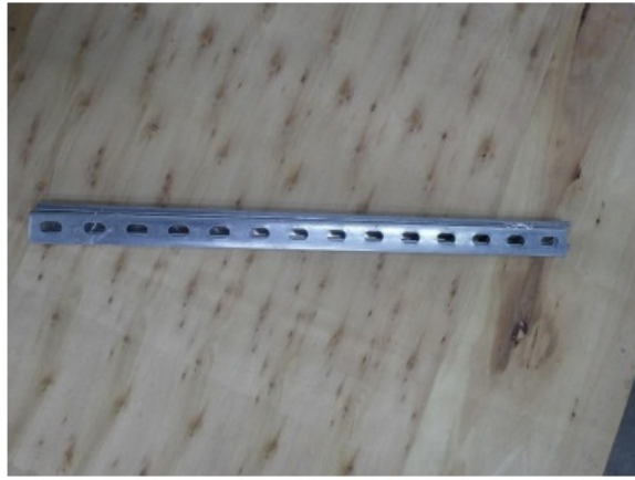
Figure 3: Unistrut