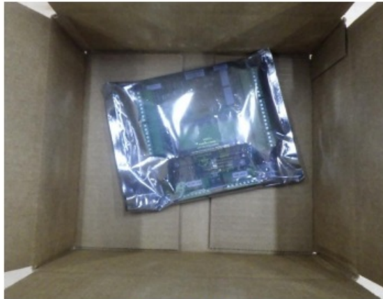
Figure 6: COP SRU Board