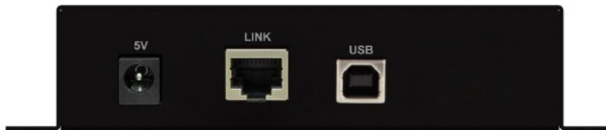
USB2CX-TX Back panel