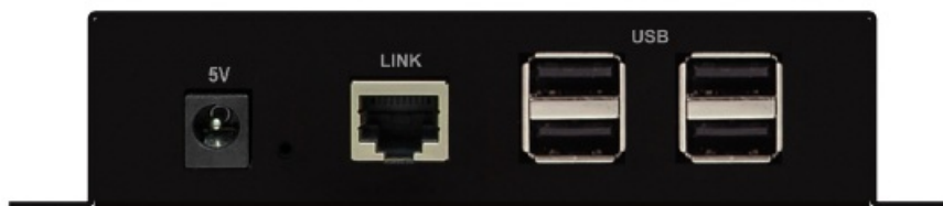
USB2CX-RX Back panel