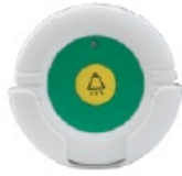
433-RB Reset Button