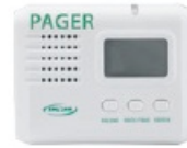
433-PGD Caregiver Pager