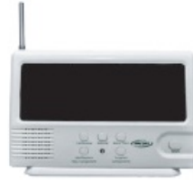
433-CMU Central Monitor