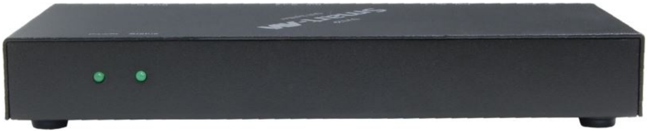
DVS2P Front Panel