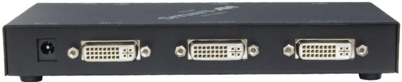
DVS2P Back Panel