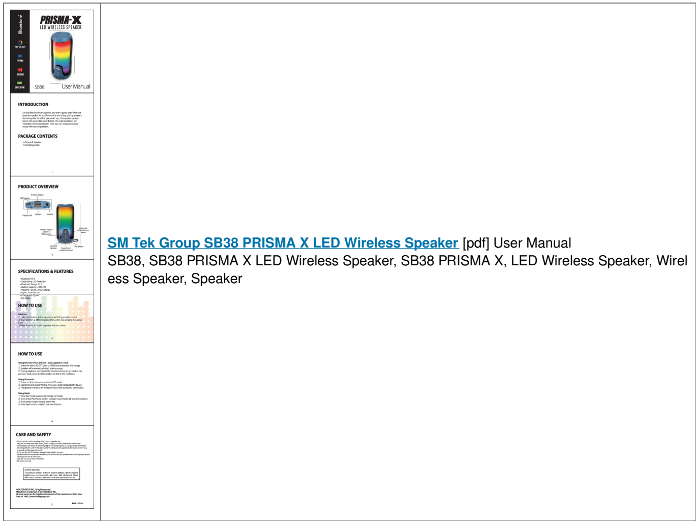
SM Tek Group SB38 PRISMA X LED Wireless Speaker [pdf] User Manual SB38, SB38 PRISMA X LED Wireless Speaker, SB38 PRISMA X, LED Wireless Speaker, Wireless Speaker, Speaker