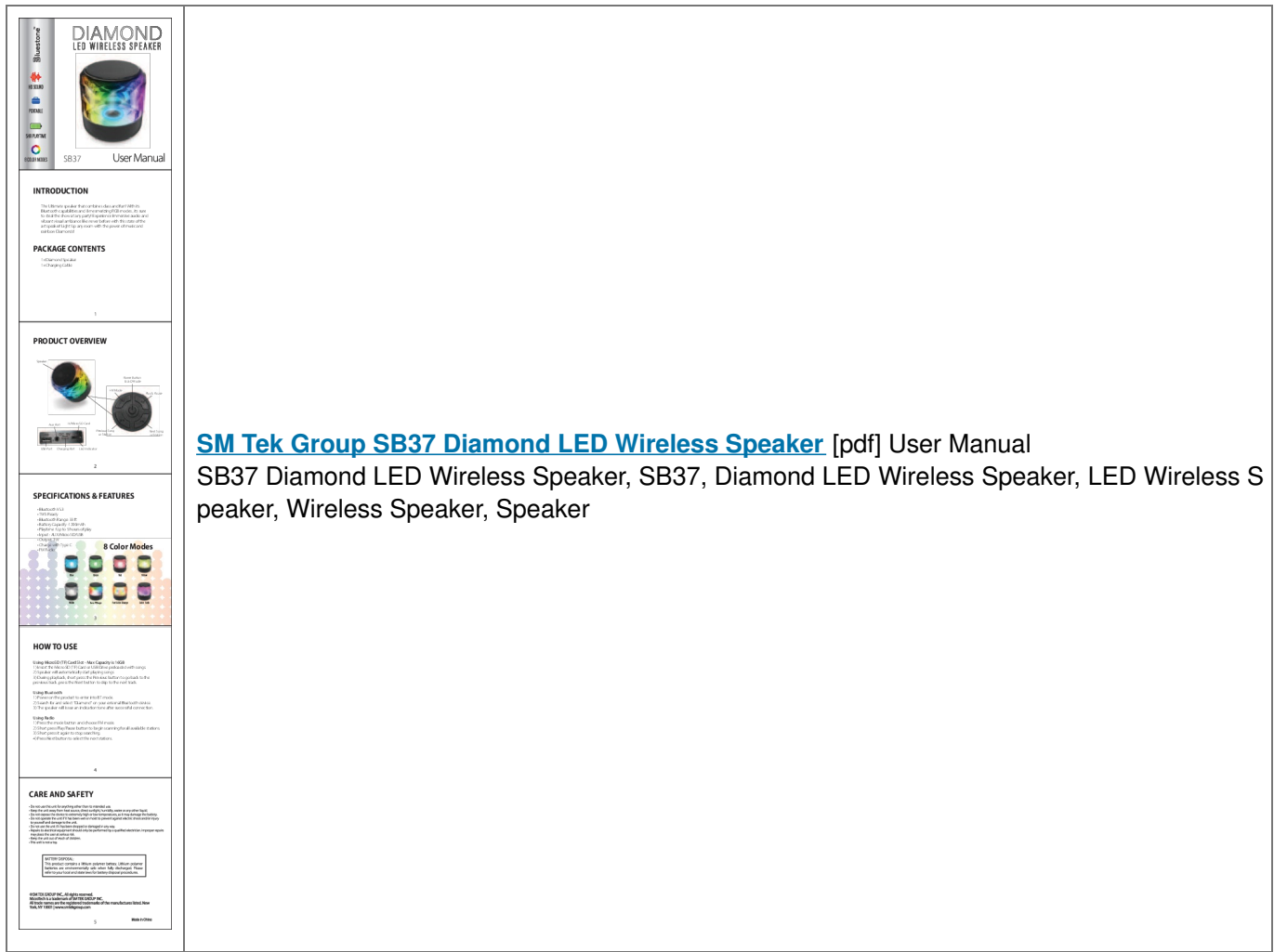
SM Tek Group SB37 Diamond LED Wireless Speaker [pdf] User Manual SB37 Diamond LED Wireless Speaker, SB37, Diamond LED Wireless Speaker, LED Wireless Speaker, Wireless Speaker, Speaker