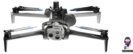
Skydio X10 Versatile Quadcopter Drone