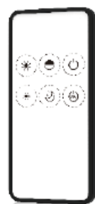
RM1 1 Zone Dimming

1 zone dimming/6-key/Wireless remote 30m distance/CR2032 battery