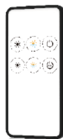
RM2 1 Zone CCT