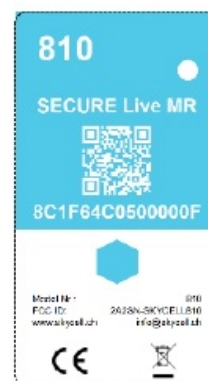
Figure 2: Secure MR Logger Label