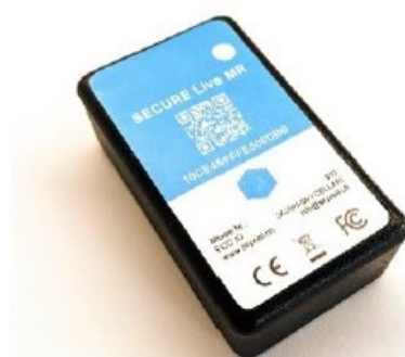
Figure 1: Secure MR Logger