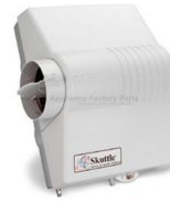
Skuttle 2101 Home Humidifier