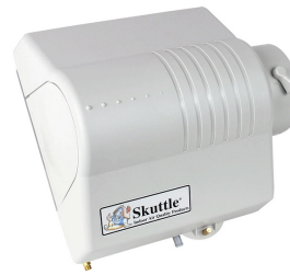
SKUTTLE 2000 SERIES HOME HUMIDIFIERS